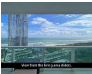
View from the living area sliders.