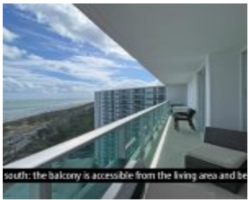
south: the balcony is accessible from the living area and be

ARLEN HOUSE EAST CONDO UNIT 2107 UNDIV .1705% INT IN COMMON ELEMENTS CLERKS FILE 75R 160889 F/A/U 30-2214-018-5470 OR 18529-3597-3601 0399 4 Contact the listing agent to see this unit. High floor best line unit with direct ocean views from the living area and both bedrooms. Full length balcony accessible from the living area and [...]